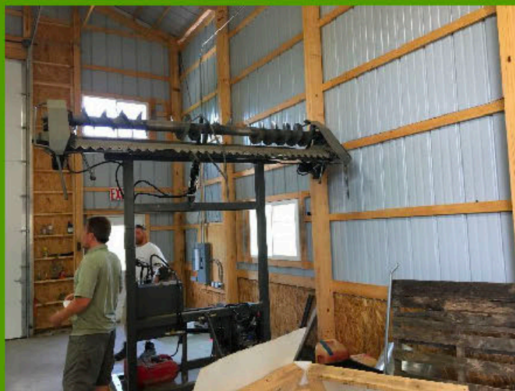
Remove general clutter