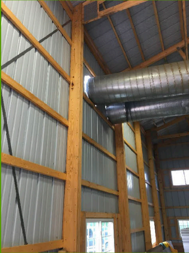
Picking Facility Ventilation