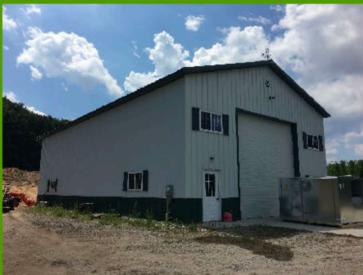
Picking and Kilning Facility